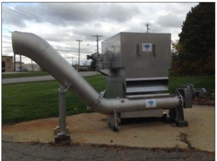
Stainless steel construction

14500 Industrial Ave. South Maple Heights, OH 44137 P: 216-475-5225 F: 216-475-5229 info@or-tec.com