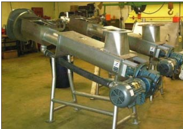
Compactors with back pressure plate

OR-TEC Compactors are designed for applications where compacting and washing of screenings is required. A screw auger slowly moves the screened material and spray headers add washwater to clean the screenings. The screenings are then compacted using a swan neck or back pressure plate. Compacted material is discharged at a convenient height for easy disposal.